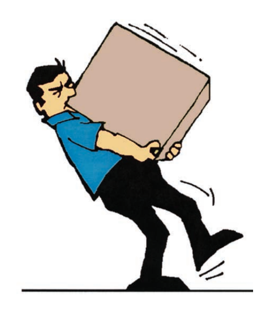
carry heavy objects